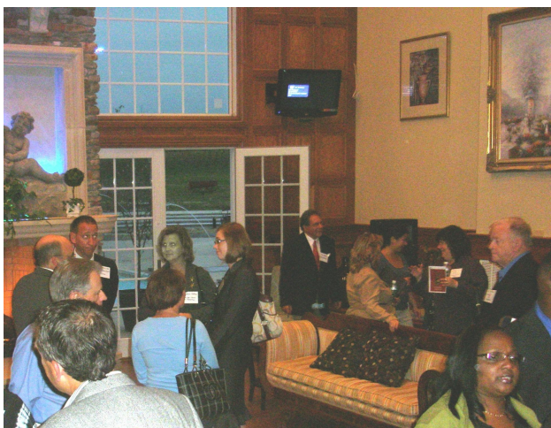
October Business Card Exchange Sponsors: First National Bank of Palmerton (left background)