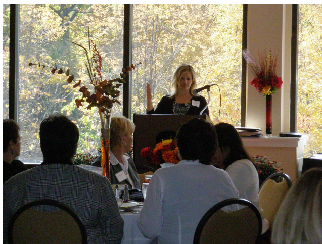
October Luncheon Sponsor, Riverside Rehabilitation