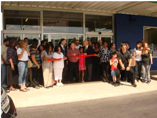
Weekend Bargains Flea Market

Weekend Bargains Flea Market , located at 51 N. 3 rd Street in Stroudsburg recently celebrated their Grand Opening with a ribbon cutting ceremony. This year-round, indoor flea market currently has approximately thirty vendors selling a wide variety of merchandise. Weekend Bargains offers plenty of on-site parking, an on-site ATM machine, and a concession stand located inside the market. Vendor space is available! For more information, please contact (570) 350-9550 or visit www.weekendbargainsfleamarket.com .