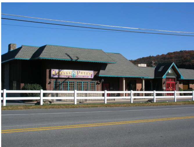
Alaska Pete's Roadhouse Grill and Moondog Saloon

Alaska Pete's Roadhouse Grill and Moondog Saloon is the Restaurant of the Month for November. This fine dining casual restaurant is located off of exit 309, on Route 209 north. Alaska Pete's is well-known for its warm, North-western interior and friendly atmosphere. It has earned its reputation as one of the Pocono's premier steak-house and fresh seafood restaurants. The restaurant is open 7 days a week 11:00 a.m. - close. For the month of November, all Chamber members receive 25% discount. For more information, visit www.alaskapetes.com or call (570) 223-8575.